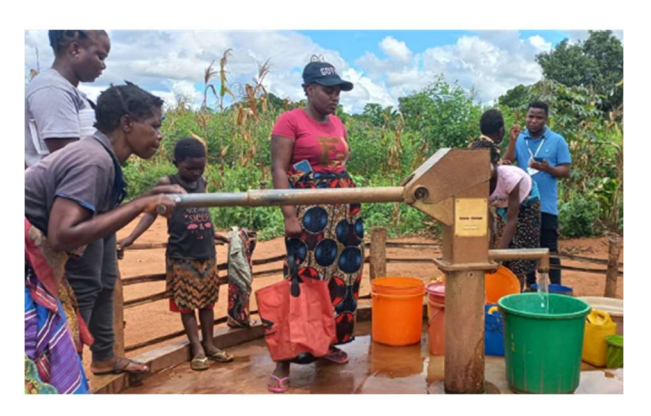
Interview during RANAS baseline data collection Mozambique

We conducted quantitative baseline surveys in 290 households from Cabo Delgado Province and Nampula Province in Mozambique in April/May 2022 and in 388 households from Diana Province in August 2023. Self-reported data was collected on respondents' payment for water services from improved water points and the corresponding behavioural factors.